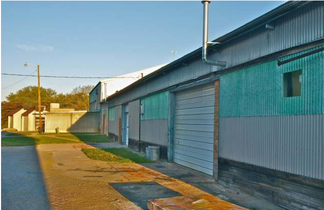
Southwest View Before Fire