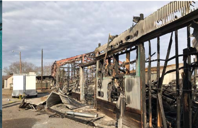
Southwest View After Fire