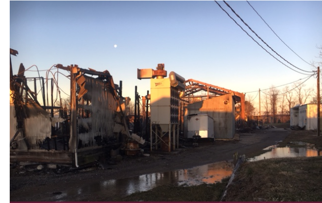
Northeast View After Fire