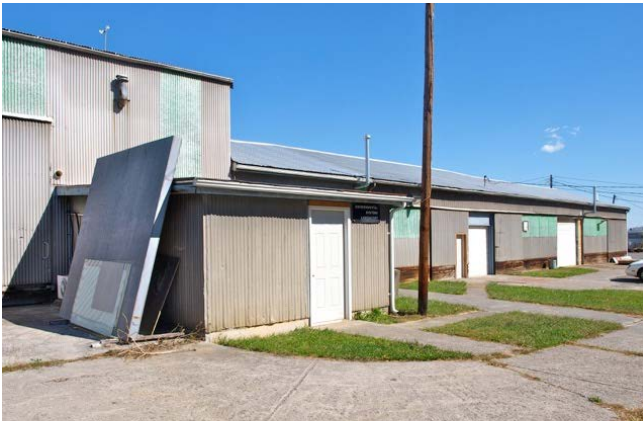
Southwest View Before Fire