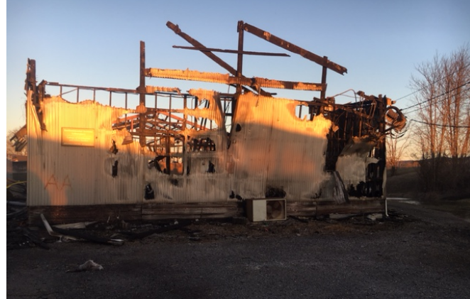
East View After Fire