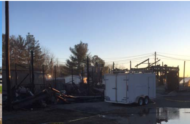
Southwest View After Fire